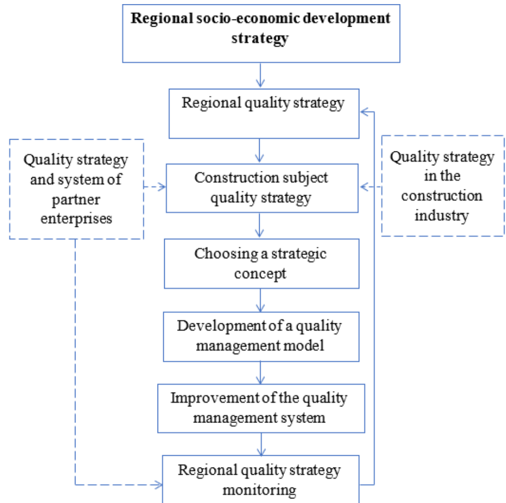
Figure 1. Methodological approach of quality management in enterprises and organizations of the territorial construction complex.

In the scheme presented in the figure above, the quality strategy of the region serves to fulfill its socio-economic development strategy, that is, it is focused on increasing regional competitiveness. The structure of the scheme aims to reveal what quality management is, what it depends on, and how it works. Its starting point and end point is the regional quality strategy.